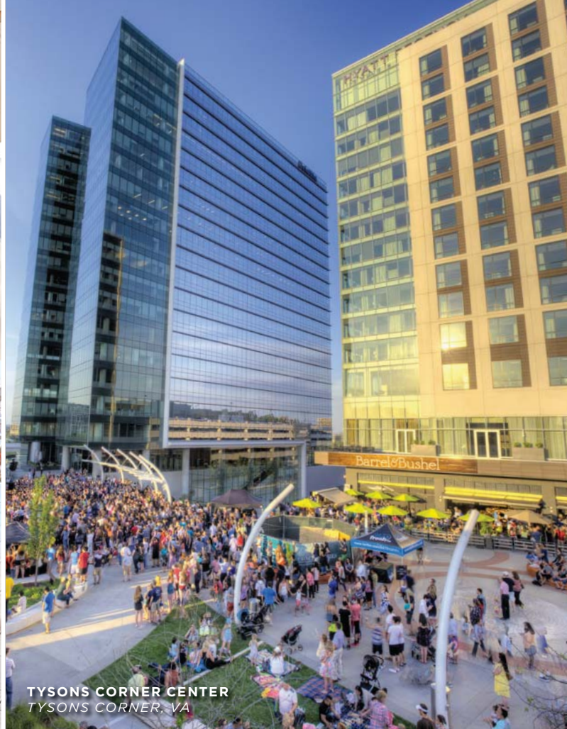
TYSONS CORNER CENTER TYSONS CORNER, VA