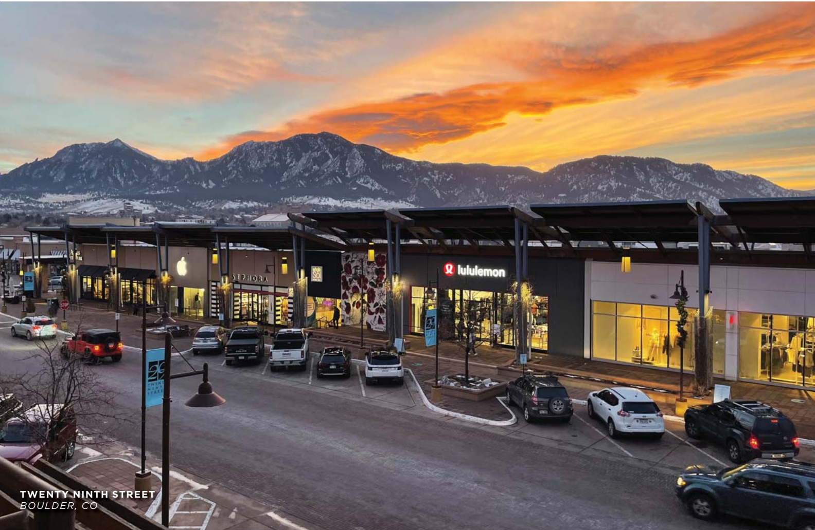
TWENTY NINTH STREET BOULDER, CO