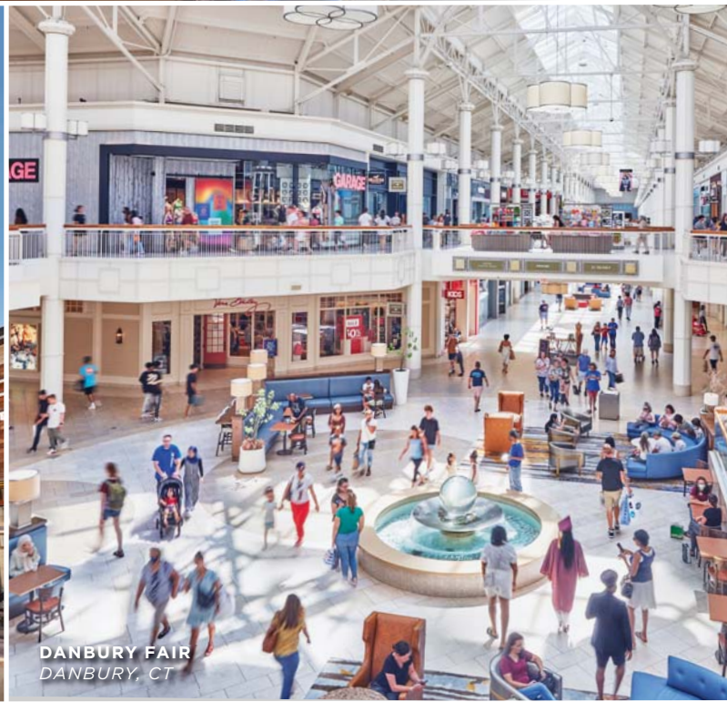
DANBURY FAIR DANBURY, CT