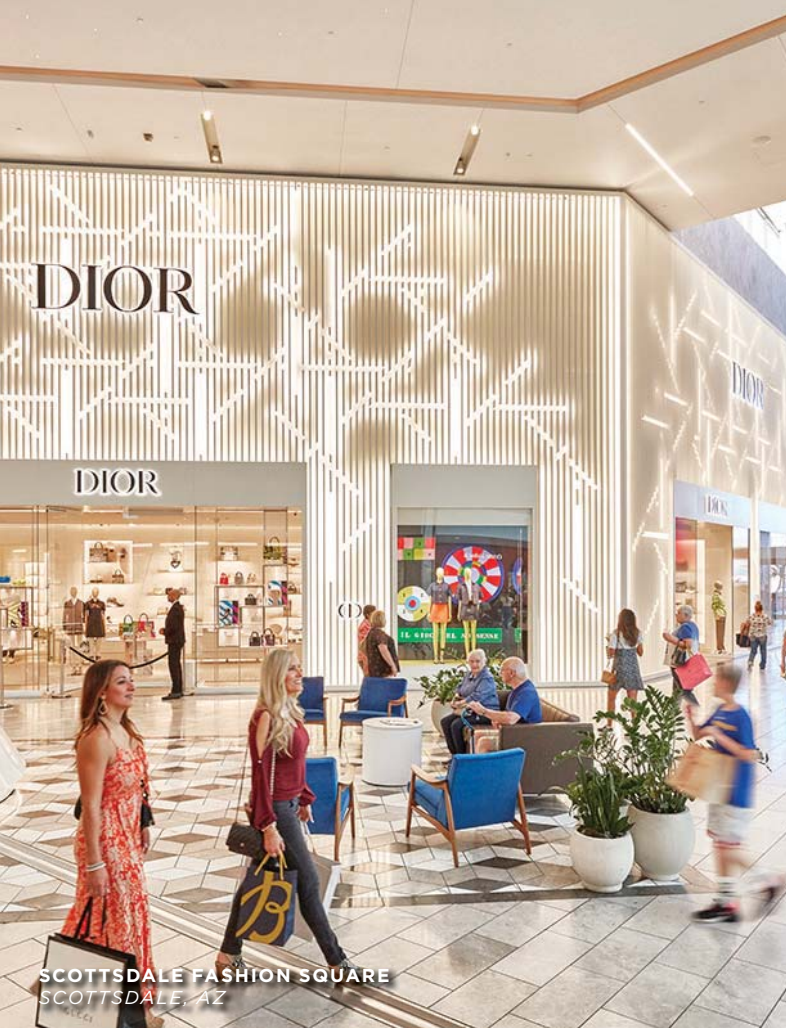
SCOTTSDALE FASHION SQUARE SCOTTSDALE, AZ