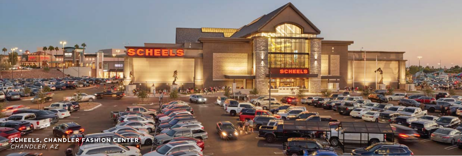
SCHEELS, CHANDLER FASHION CENTER CHANDLER, AZ