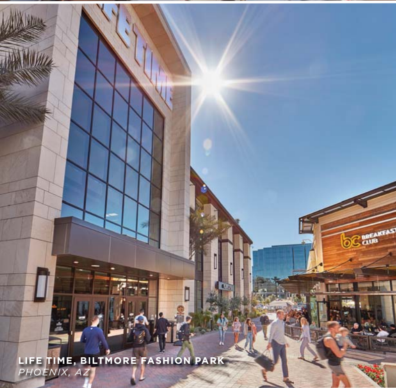
LIFE TIME, BILTMORE FASHION PARK PHOENIX, AZ