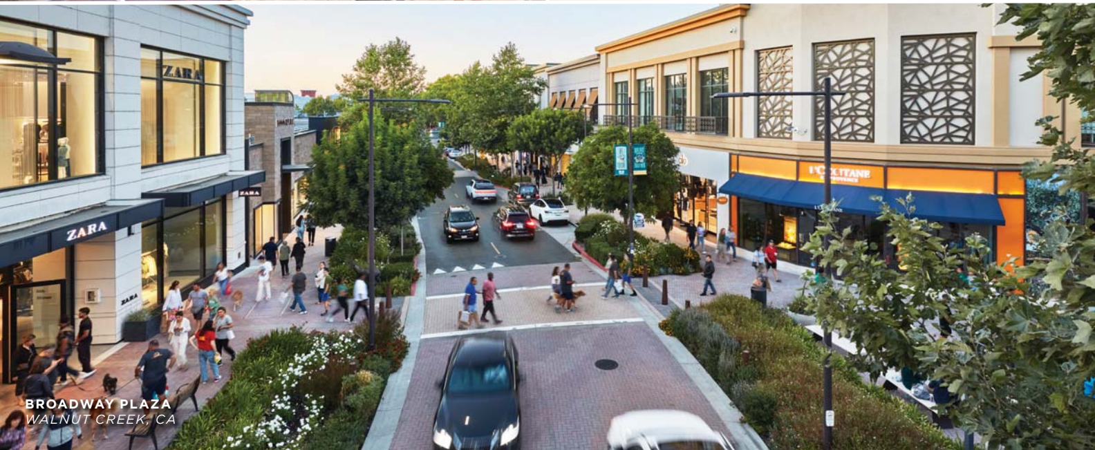
BROADWAY PLAZA WALNUT CREEK, CA