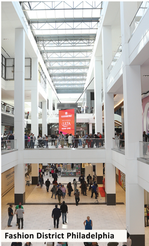
Fashion District Philadelphia